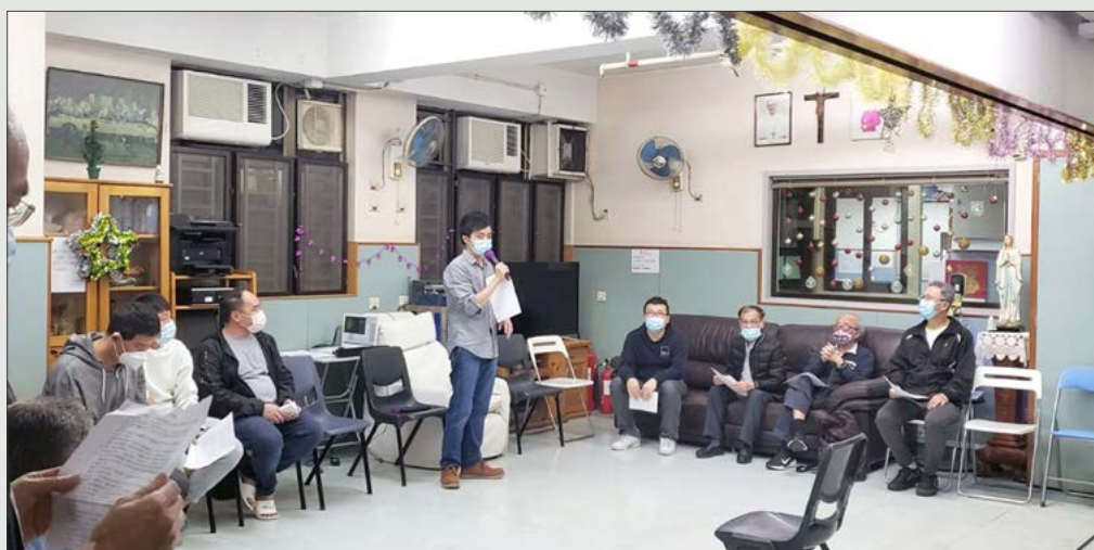
Christmas celebration co-organized with St Mary's Church