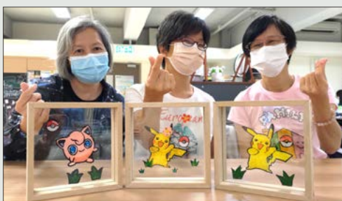
Participants enjoying the journey of arts and creativity