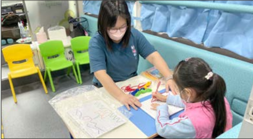
A safe, quiet and suitable environment for children training was provided in Mobile Training Centre

We received a support of $1.13 million from the Lotteries Fund to purchase a new vehicle for setting up a Mobile Training Centre. The vehicle will park at safe locations and areas close to the schools and will serve as an extension of schools providing training to children with special needs and counselling services to parents and teachers. Our service will also be available during school holidays and suspension of classes.