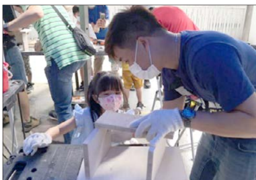
Imitating Carpenter St Joseph, father and child crafted a wooden stool together

In promoting gender equality and total family participation of men, Caritas Men Centre has implemented Project Cedar and over 7,000 male users were served in the last two years. "Male voices in the pictures" photo roadshow demonstrated men's willingness to open up and participate in new family culture with fairness and intimacy. In the "Year of St Joseph," the Centre also worked with the Diocesan Pastoral Commission for Marriage and the Family to provide programmes which emphasized on the importance of fathers showing their love and care in actions.