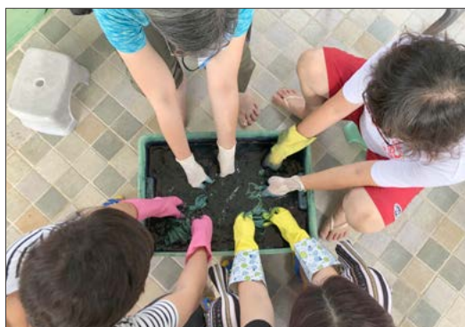
The Village Lady learned and practised natural dyeing handicrafts together