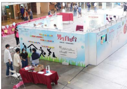
Caritas Men's Festival 2021 conducted at Lok Fu Plaza