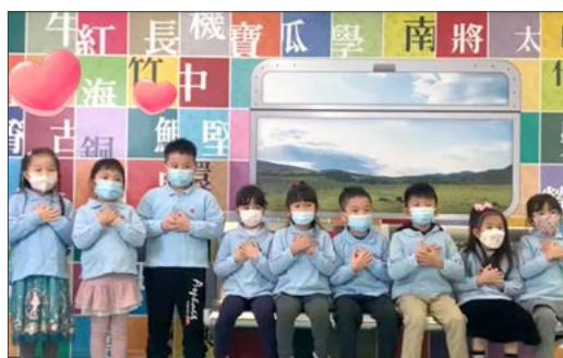
Thankfulness from the children for the priority seats donated by MTR

We believe in sowing the seed of love at an early stage of childhood and cultivating positive attitudes can help children to work through difficulties they may face. This year, children were encouraged to participate in a series of actions of love at different venues including schools, home and community. With the theme "Peace and Joy," children were taught to observe and offer priority seats to people in need, giving them the real life experience to put school's motto of "We Love Each Other" into practice.