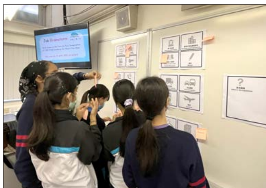
Students participated in life planning training workshop

In 2021, we launched the programme "Provision on Services of Providing Life Planning Education Activities for NCS students in Secondary Schools (2021/2023)." It provided career development support to Secondary 3 to Secondary 6 non-Chinese speaking students through different activities such as training sessions and workplace visits. We also launched "Parent Education Programmes for NCS Parents (2021/2022)" which provided educational activities for their parents to better understand the essence of Hong Kong education system and the importance of supporting their children's life planning and career development.