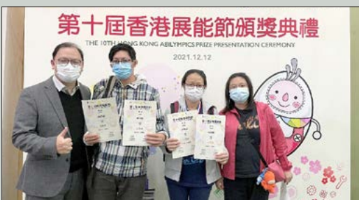
Winners of Abilympics

Abilympics, derived from "Olympics of Abilities", is a widely recognized vocational skills competition for persons with disabilities to promote their abilities and talents. In the 10 th Hong Kong Abilympics, service users of Caritas Joyous Link and Caritas Lok Mo Integrated Vocational Training Centre achieved outstanding results and won 13 prizes including 1 st and 2 nd Class Awards on cookie bakery, office maintenance and cleaning services, and 2 nd Class Award on washing and ironing, room service and English word processing.