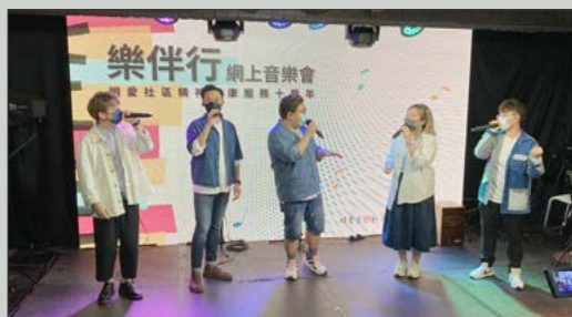
A cappella band "SENZA" sang the winning song "Escort Me" in the Online Concert