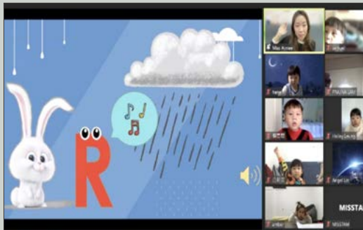
Online English activity

To support and provide children with full-day class during COVID-19, the mixed learning mode was continued this year. Learning materials and play activities were delivered online via the schools' e-platform. In addition, emotional support to both parents and children were provided through the collaboration with the school's social work services in a virtual way.