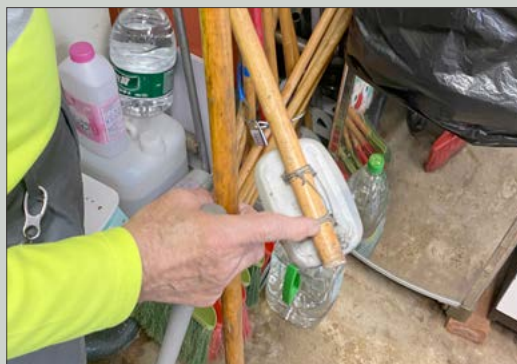
Cleaning workers applied enduring wisdom to their daily work by using DIY tools