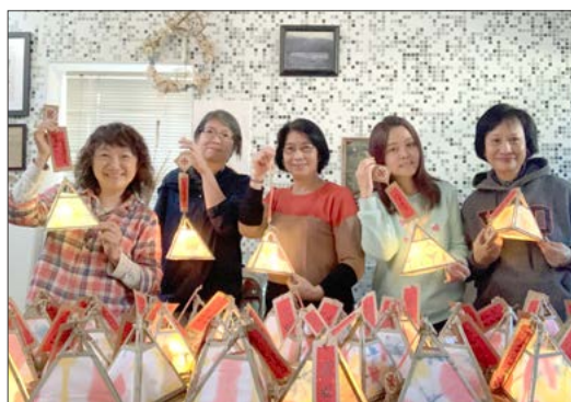
The Village Lady used natural-dyed paper to make bamboo lanterns

Through Caritas Pokfulam Community Development Project, we worked with local villagers to develop sustainable living in the village through cultural heritage conservation. A group of women formed the "Village Lady" to study and make traditional handicrafts. They decorated the village with their handmade ornaments to celebrate the traditional festivals. Through their participation in these cultural activities, cohesion among villagers were developed.