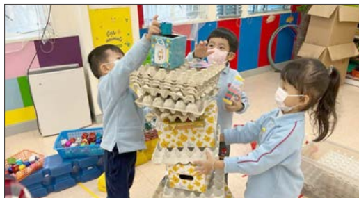
Amazing creativity of children – a Christmas tree