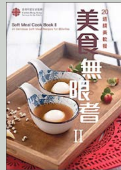
Soft Meal Cook Book II

To promote the concept of "eating well" to elderlies with swallowing difficulties, we prepared and published our second bilingual cookbook in September 2021 offering 20 easy, nutritious and appetizing soft meal ideas to nourish the elderlies' body and soul, strengthening caregivers' competency and cultivating family bonding.