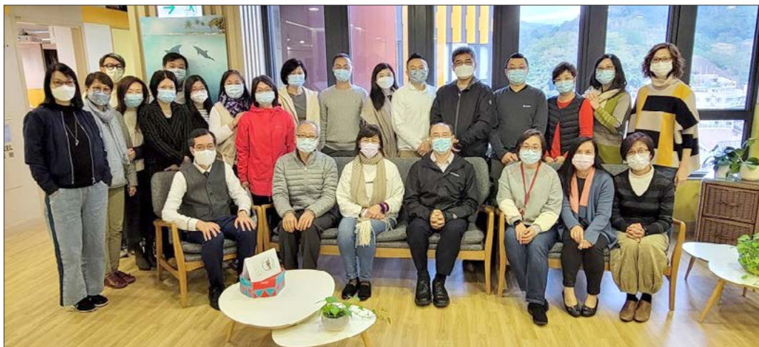
Collaboration of Caritas Family Service Division and Caritas Education Services Division

In future, we will continue to cooperate with our Diocese, Education Services Division and Catholic schools to further promote this framework and develop related practices.