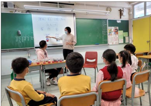
Training group on social thinking was designed for students with Autism Spectrum Disorders

We have been awarded $22.5 million by the Education Bureau to offer new services to 900 students with Autism Spectrum Disorders studying in ordinary primary and secondary schools. 450 coaching programmes will be offered from 2021/2022 to 2023/2024 school years. The team will be multidisciplinary consisting of social workers, educational psychologists, and speech therapists; and teachers will work closely with us to provide small group training and transactional support services to participating students.