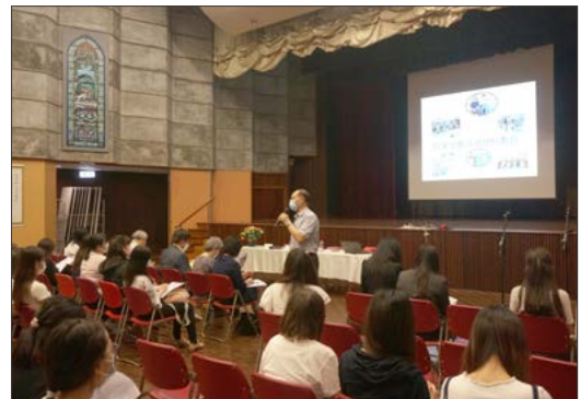
Sharing from Associate Director of Education Services