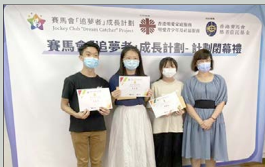
Scholarships were presented to mentors and mentees

This Project was designed to help students with special education needs and underachievers to improve their academic performance by providing tutorial support on learning strategies, goals-directed activities like social skills training to enhance students' motivation and their stress coping skills amidst COVID-19. In this Project, mentors received training on peer counselling, leadership, problem solving, online application skills as well as relevant knowledge on gatekeeper's role. The results were encouraging as both mentors and mentees showed significant improvement in taking care of their mental health and self-management skills. Over 90% of the participants improved in stress coping and emotion regulation, 88.5% of the participants gained positive support and learned useful self-management skills and 84% of the participants improved their knowledge in managing online learning.