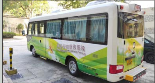
Outlook of the Mobile Training Centre