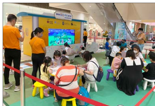
Families enjoyed AR Power Train Exhibition