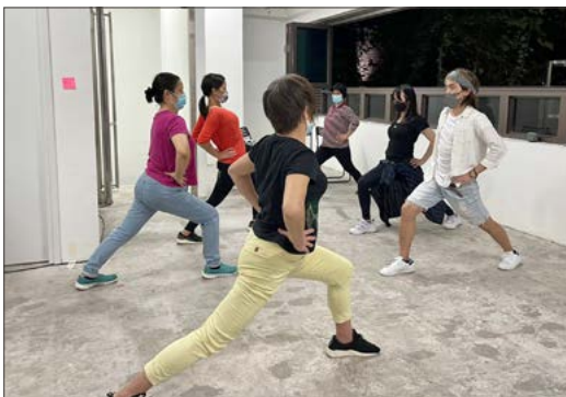
Stretching Exercise Workshop

Co-organizing with Health In Action, this Project joined forces of the local communities of sub divided units, residents in Central & Western and Southern Districts, social workers and medical professionals to provide holistic services to our service users. The Project helped to enhance the community's capacity to access essential health services such as running community pharmacy and physiotherapist-based gymnastic class. Further, in collaboration with families of sub-divided units, a "second home" was created where everyone could cook, eat and exercise together. We also promoted a healthy lifestyle in the neighbourhood by hosting various activities with the neighbours.