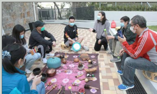
Co-learning session of Empowerment Programme Modules - With the Use of Expressive Art