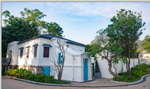
The main building of The Pokfulam Farm (Grade 1 Historic Building) after revitalisation work

The Robert H. N. Ho Family Foundation Hong Kong funded a two-year project named "Pokfulam Regeneration." It aims to connect Pokfulam neighbourhoods and strengthen coherence and linkage among individuals. Various co-learning sessions, workshops and activities were launched to promote a community-based model of sustainability development and mutual support.