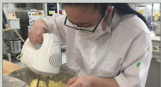
Cookie bakery competition