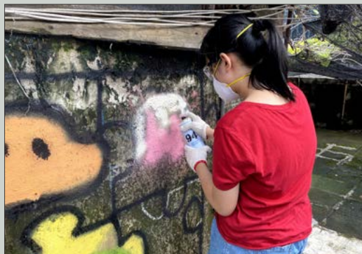
Decorating the rooftop by making graffiti art

By turning the rooftop into a community playground, the families of sub-divided units at Kim Shin Lane in Sham Shui Po could meet and connect with each other. The residents decorated the rooftop by making graffiti art. They could also exercise and enjoy the sunshine in a lovely environment. The establishment of a new common area fostered a spirit of mutual support and a sense of belonging among the residents. The revitalization of rooftop enriched the social connection and improved both mental and physical health of the residents.