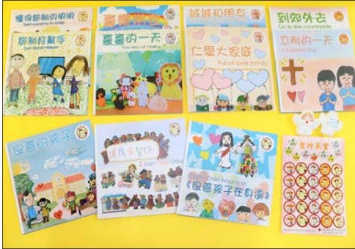
11 stories on moral development created by children