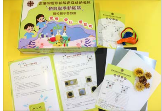
Production of a parent-child play kit