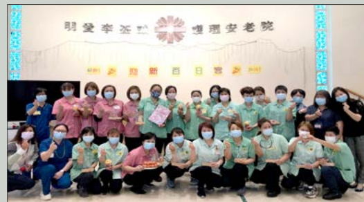
Celebration for new colleagues after working with us for 100 days

To put our motto "Love in the Service of Hope" into action and foster communication and rapport between our new and existing colleagues, the residential care service of our service for the elderlies introduced innovative team-building and mentoring activities to facilitate the exchange of work experiences and nurture mutual understanding and support.