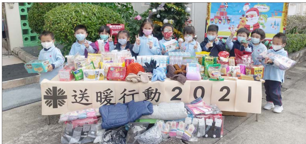
"Let's present the gift to the elderly"