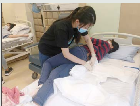
Diaper changing practice