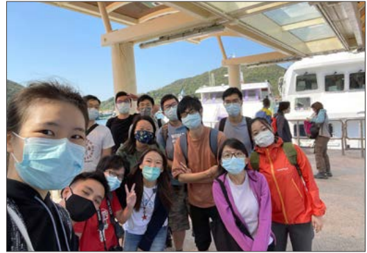
Supportive group - Hiking programme