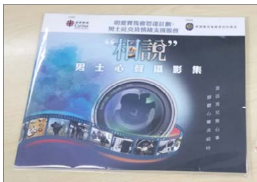
"Male voices in the pictures" photo album and game card set