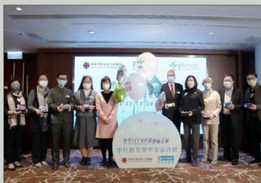
Joint School Recognition Ceremony with Lee's Pharmaceutical Holdings Ltd.

With the Scholarship, one of the beneficiaries could quit his part-time job in a fast food restaurant at night and focus on his study. He was later admitted to his dream Engineering Programme at The Hong Kong University of Science and Technology.