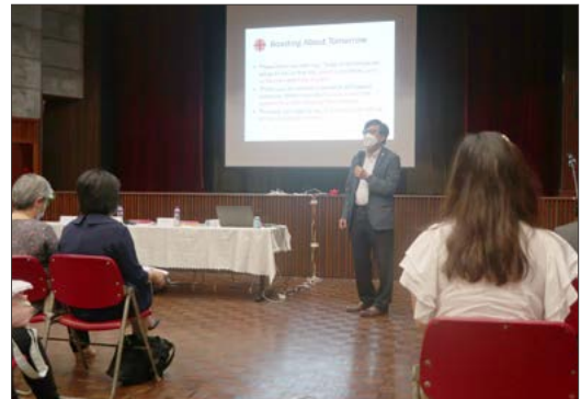
Sharing from Director of Social Work Services