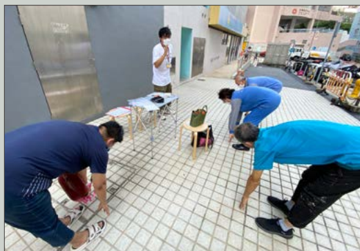
Project staff provided guidance to cleaning workers for self-testing of musculoskeletal pain

This Project was funded by KG Services Limited. A bottom-up strategy was developed with the joint efforts of cleaning workers, local communities, and multi-disciplinary professionals. The Project did not only provide cleaning workers with alleviation treatment of musculoskeletal pain and other health-related benefits, but also adopted various social innovative ideas to recognize their works and contribution to the city and allow the public to show their recognition and appreciation to them.