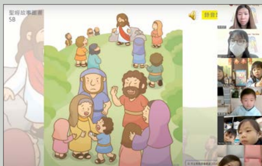
Children and parents listened to bible story online