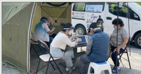
Outreaching to elderlies residing at a remote village