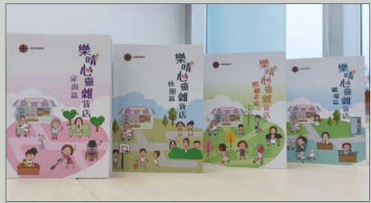
Comic Book Set – Soul Caring grocery store: To deliver mental health messages through interesting cartoons and pictures with interesting exercises and tips to raise the public awareness of mental wellness