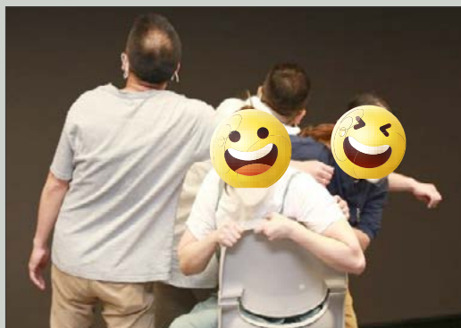
Drama performance by ex-drug abusers

In this regard, a series of therapeutic group sessions using non-verbal means was implemented, including fluid art, collage art, playback theatre, human library and photography. Service users' feedbacks were positive. During the 53 rd anniversary celebration of Caritas Lok Heep Club, their artworks were exhibited, they performed a drama and participated in experiential workshop. A total of 120 participants, including 22 representatives from 17 anti-drug organizations, participated in the programme, where they were able to experience our service users' transformation in codependency.