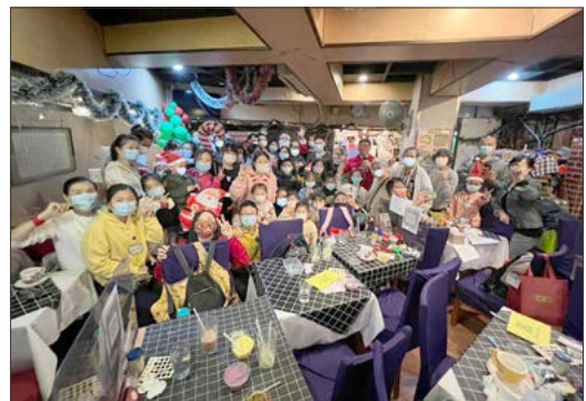
Christmas party with the neighbourhood