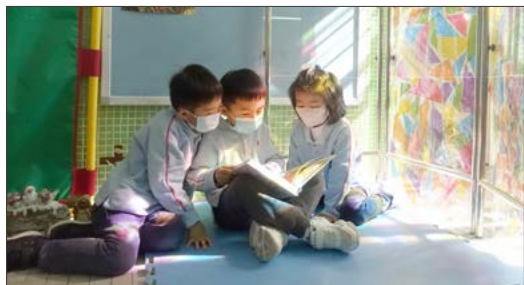
"We like to read together in our little chapel."

With the aim of cultivating the full development of children without discrimination against their abilities and social background, our Child Care Service provides educational and caring service for children aged 2 to 6, including children from single parent families, children of working parents and mildly disabled children.