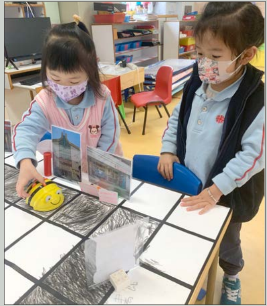
"How does the BEEBOT move to the destination?"