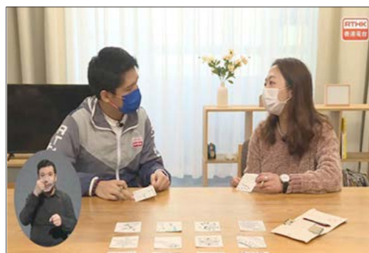
Media interview on RTHK31 TV Programme "Anti-epidemic news express"

To safeguard public's health during COVID-19, the Government has implemented different forms of quarantine and social distancing measurements. With the collaboration among different family service units and designated hotels, Caritas Integrated Family Service Centre - Tin Shui Wai implemented "QuaranCation" in November 2021. It provided a series of free online programme and 24-hour hotline service (18288) to assist people with anxiety. "Blessing Gifts" were delivered to families to meet their material needs during home quarantine.