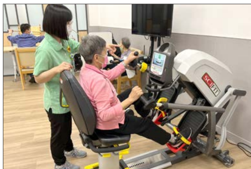
An elderly using the new rehabilitation equipment

We were successful in our application for the operation of the Centre for five years commencing January 2022. The Centre offers 40 places to elderlies in need in the North District.