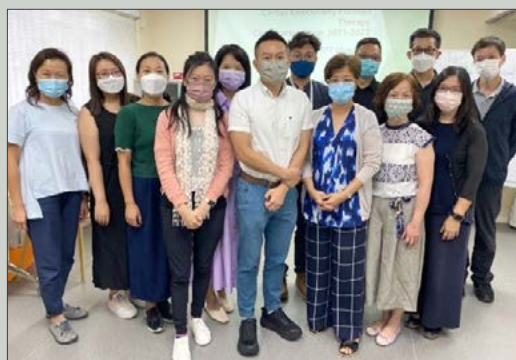
Learners in Caritas EFT Community