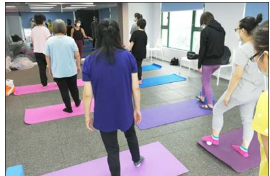
Psychosocial support group for mothers of children with special educational needs

The HKJCC Trust had agreed to support Phase II of this Project which will be for three years starting from September 2021. During this Phase II, over 15,000 will benefit from our online and direct counselling services, focus groups, programmes, educational talks, peer support services and self-help kits. The Research Team of The University of Hong Kong will assist in evaluating the effectiveness of this Project and make recommendations to the Government to incorporate the service elements of this Project into their existing service system.