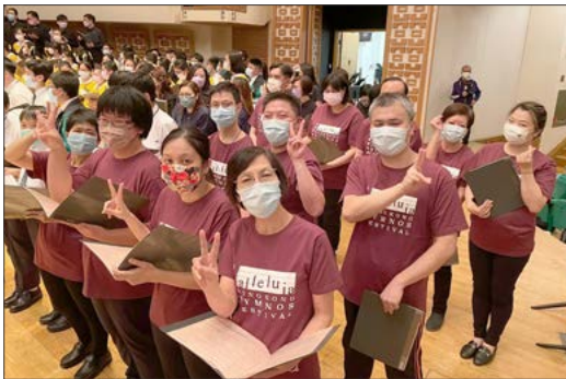
Final rehearsal on stage in Hong Kong Culture Centre

Hymnos Choir has 7 colleagues with special needs and 5 volunteers from our Service. The Choir was invited to perform in the 2021 Hong Kong Hymnos Festival on 15 November 2021 at Hong Kong Cultural Centre. The singing performance of "Amazing Grace" and "Hallelujah" offered the green singers an invaluable opportunity to gain stage experience and received applause of encouragement from the audience. The enjoyable performance also helped to promote the concept of inclusion to the public.