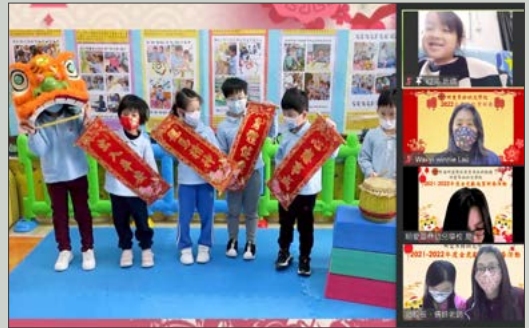
"Wishing you a Happy New Year of the Tiger!"