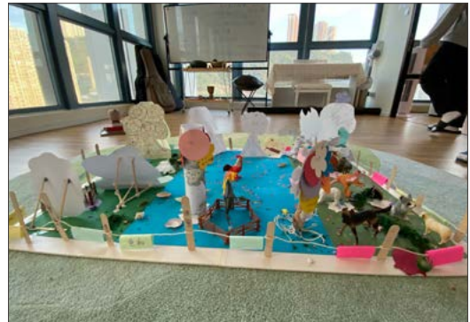
Co-creating the "grassland"

Funded by The HKJCC Trust, this Project provided comprehensive support services to youths with mental health needs. It adopted a user-friendly and innovative youth engagement approach in offering appropriate assistance and emotional support to them in the school setting. Different workshops were held to ease participants' stress and help them to develop positive life values.