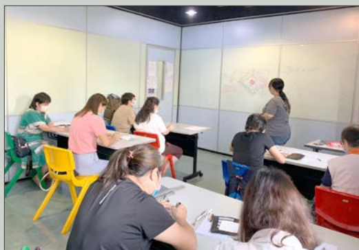
The tutor of CLAP@JC conducted Zentangle Workshop

Funded by The Hong Kong Jockey Club Charities Trust ("The HKJCC Trust"), CLAP@JC provided support services on career and life development for young people. It was encouraging that 364 at-risk youths benefited from the second phase of the Project, helping them to pursue an appropriate career path. The capacities of the youths were built, their problems were addressed and their aspirations were fulfilled during the whole process.