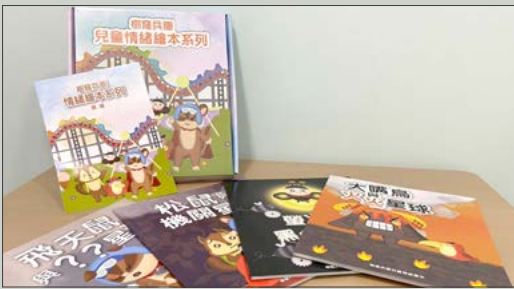
Tree Cave Adventures Children Picture Book Set: An indigenous, child-focused and mental-wellness-oriented educational kit to prevent children from mental distress and promote mental health awareness and acceptance of children's emotion