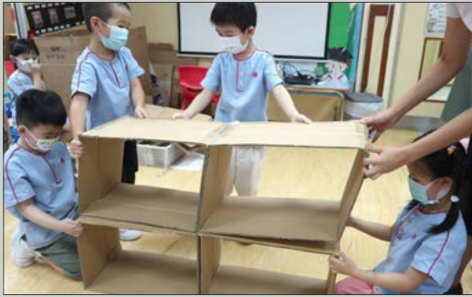
"How can we make a stand to place the masks?"

To initiate independent learning and problem solving skills of children, as well as fostering their high order thinking skills, all Caritas nursery schools adopted Developmentally Appropriate Practice by providing various exploratory learning experiences to children. This contributes to the all-round development of children.