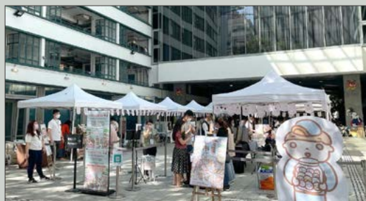
A variety of products related to mental wellness were provided in "Market Soul"