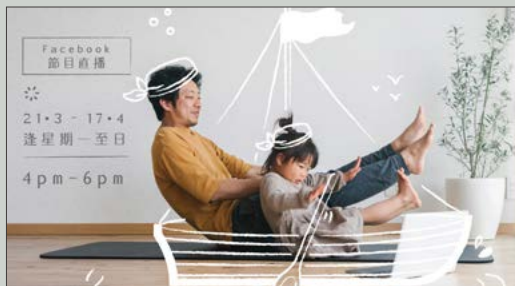
Promotional poster of "Stay With You" Channel