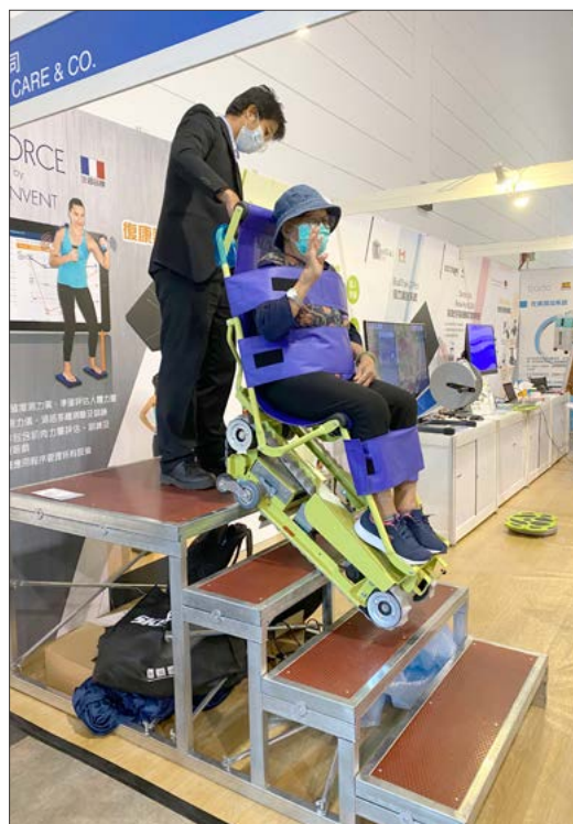
An elderly tried the mobile stair climbers at the Gerontech and Innovation Expo

Elderlies were invited to visit the Gerontech and Innovation Expo cum Summit ("Expo"). In the Expo, they had the opportunity to experience gerontechnology, which stimulated their interests in using innovation and technology for a better quality of life in their communities. With the assistance of staff from the Hong Kong Science & Technology Parks Corporation, a group of technicians visited rural villages to test and improve the network coverage. That was greatly helpful to ensure emergency rescue service would receive elderlies' call for help without delay.