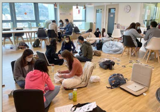
Staff development programme for frontline workers