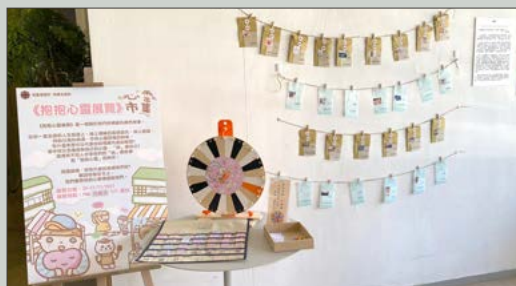
Audience connected with the storytellers by sharing their feedback to pictures and stories exhibited