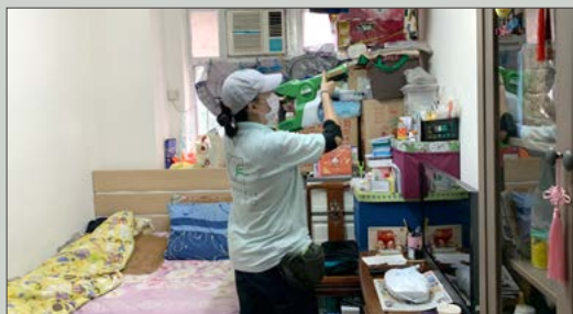
Providing cleaning and disinfection service to families of sub-divided units