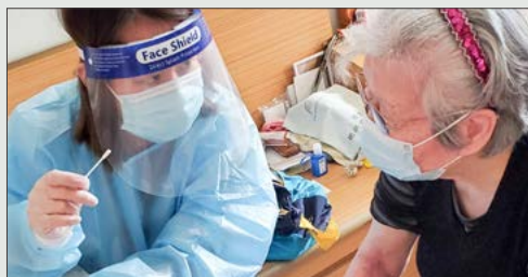
Volunteer teaching the elderly to conduct the rapid test by herself

"It was such a valuable experience for me to help the people in need in this predicament!" the student volunteer reflected with a smile of contentment.