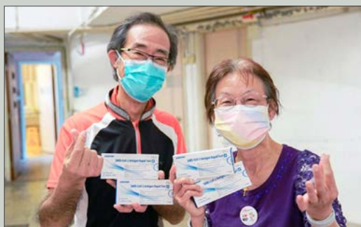
Blessing bags were delivered by the volunteers to families in need in Tin Shui Wai

Thanks to the generous donations from the local community, we were able to prepare and distribute anti-pandemic care packs to underprivileged families through liaising with schools. With the joint effort of our local community partners such as our parishes, blessing bags were prepared and gifted to families in quarantine and vulnerable people including street cleaners and infected household helpers, offering them care and support during the hardship.