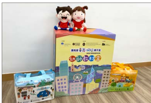
Jockey Club Interactive Wonder Boxes and Teaching Kit

Beside the Wonder Boxes, as many as 9,372 teachers attended 21 different sessions of Zoom trainings in order to familiarize themselves with the use of the training kits. 33 teachers joined the focus groups and offered their opinions. In total, 1,500 teaching kits were delivered to 606 kindergartens.